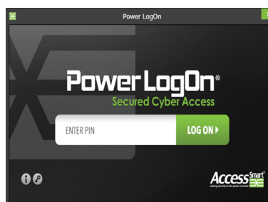
Windows Logon Screen

Combine multiple card technologies - RFID, mag stripe, custom graphics, bar codes, and so much more - onto one CR-80 card body. IT and HR only need to issue and manage a single credential.