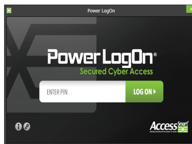
Windows Logon Screen