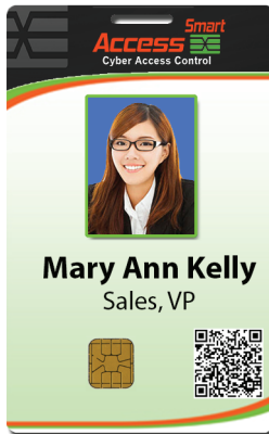
Power LogOn COA works with existing certificate ID badge

Power LogOn GOV-COA works out-of-the-box with most certificates as found on PIV/PIV-I/CAC/ CIV credentials that have been issued a certificate to facilitate secure login to Windows and applications.